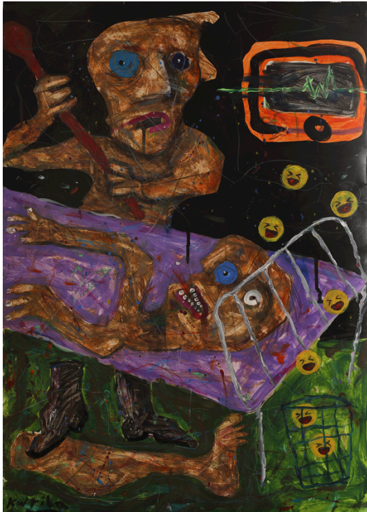
Kutaiba Mamou, o.T. | o.J. Acryl, Mixed media on paper | 70 x 50 cm