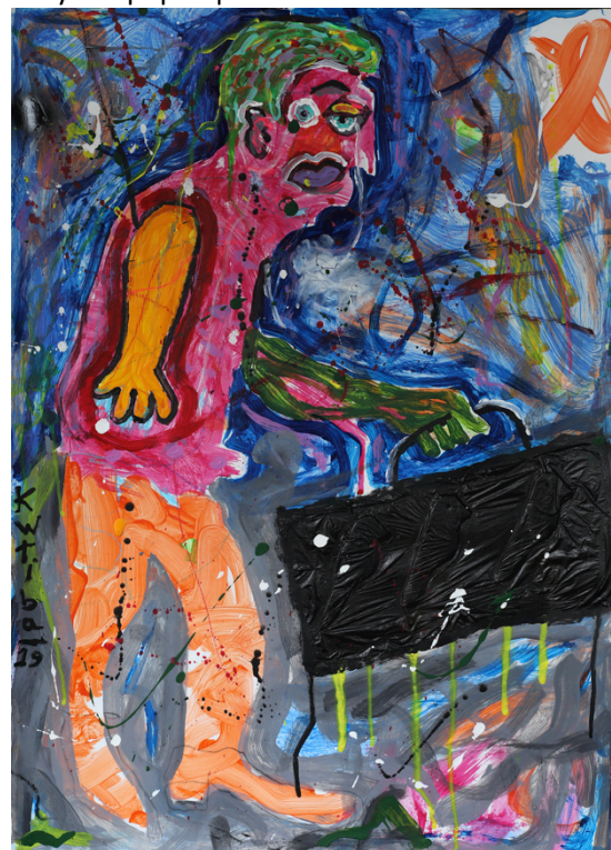
Kutaiba Mamou, o.T. | 2019 Acryl, Plastic foil on paper | 72 x 51 cm