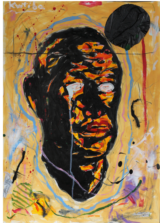
Kutaiba Mamou, o.T. | o.J. Acryl on paper | 71 x 49 cm