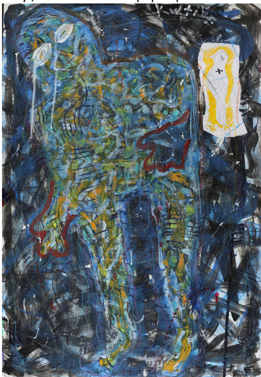
Kutaiba Mamou, o.T. (Frontier) | 2019 Acryl on paper | 71 x 49 cm